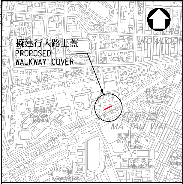
索引圖 KEY PLAN 比例 SCALE 1:15000