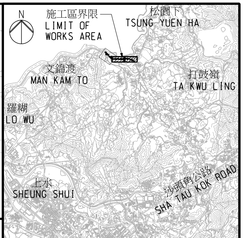
位置圖 LOCATION PLAN