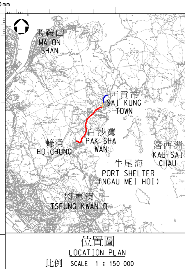
位置圖 LOCATION PLAN 比例 SCALE 1 : 150 000

擬在白沙灣興建一條橫跨西貢公路的行人隧道，並興建升降機 PROPOSED CONSTRUCTION OF A SUBWAY ACROSS HIRAM'S HIGHWAY WITH ASSOCIATED LIFTS AT PAK SHA WAN