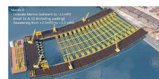
檢視臨時填海工程的施工可行性 Review of constructability of the temporary reclamation works