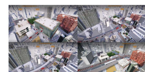
拆卸油蔴地停車場大廈及重置 加士居道天橋的4D工程規劃模型 4D phase planning for demolition of Yau Ma Tei Carpark Building and re-provisioning of Gascoigne Road Flyover

Construction sequence and space requirements are visualised in the 3D model to optimise resources allocation and reduce site wastage.