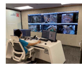
中九龍幹線的智慧工地管理平台 Smart Site Management Hub of CKR