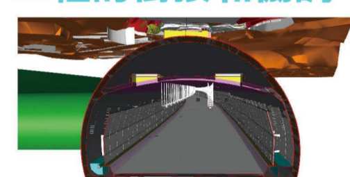
使用建築信息模型製作的衝突分析 Implementation of clash analysis with BIM

不同範疇的工程團隊成員運用建築信息模型制定良好的設計方案，透過使用空間協調及衝突分析，加強工程團隊的溝通及加快工程的進度。