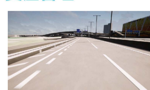
利用駕駛路線模型作交通管理 Drive-through model for traffic management

透過將營運及保養部門的資產信息要求 (AIR) 納入建築信息模型，工程團隊可以審視營運及保養程序的要求，從而提高可持續發展評估的效率、竣工紀錄管理、保養時間編排、空間利用管理，並協助分析系統的能源表現。