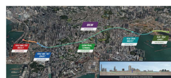
中九龍幹線概覽 Overall view of CKR

建築信息模擬技術被廣泛應用於不同項目的勘察和初步設計階段中，其中包括中九龍幹線及十一號幹線項目。 Building Information Modelling (BIM) Technology is widely used in the investigation and preliminary design stages of different projects, including the Central Kowloon Route and Route 11 projects.