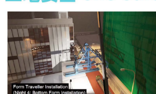
運用建築信息模型模擬重置加士居道天橋的施工流程 Simulating the construction sequence of re-provisioning the Gascoigne Road Flyover

工程團隊可利用3D模型及4D動畫協助即時識別潛在危險，以避免和減低潛在的安全風險。