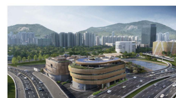
中九龍幹線啟德通風大樓及行政大樓的 建築信息模擬效果圖 BIM rendering of CKR Kai Tak Ventilation and Administration Building

BIM enhances the quality of the construction works by saving cost and time, improving safety performance and achieving sustainability.