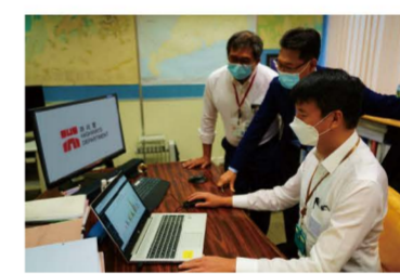
使用綜合數碼工程監察系統管理和監督建造工程 Using iDWSS to manage and supervise construction works

CKR is the first public works project with iDWSS developed to transform data from 6 contract-wide supervision platforms into 1 project-wide management platform, providing different Key Performance Index (KPI) data analysis to improve quality, safety and environmental performance in project implementation.