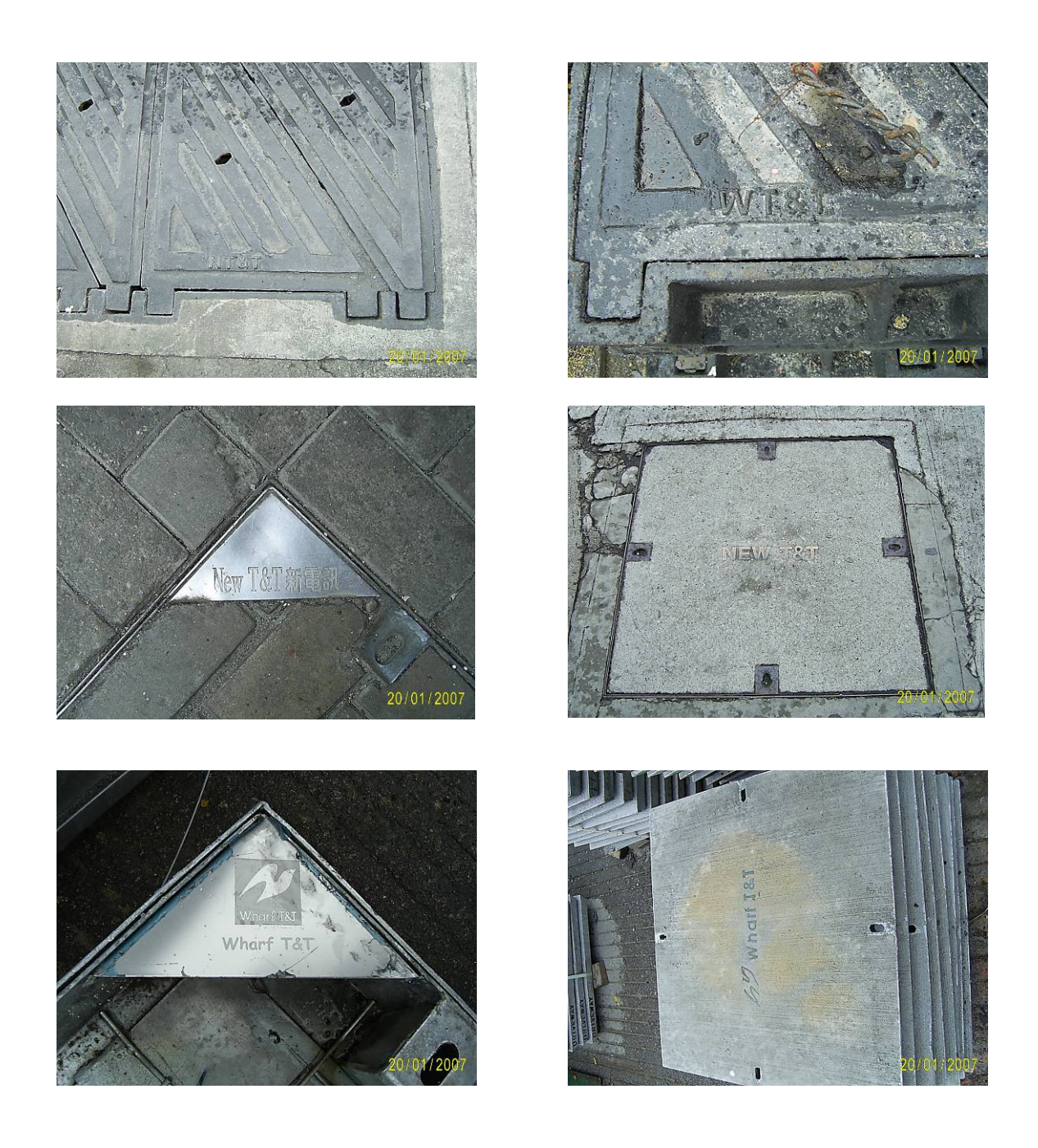
<u>Photo No.3</u> Company Logo is indicated on each Manhole / Joint Box cover