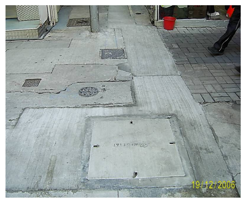
<u>Photo No.1</u> (Joint Box - Concrete Type) Covers Number: from 1-3