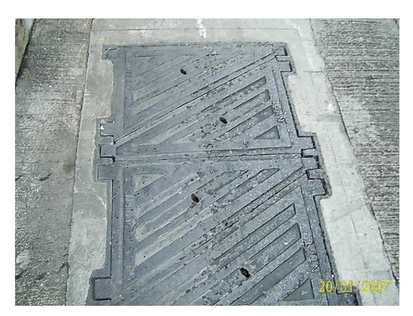
Photo No.2 (Manhole/Joint Box- Carriageway Type) Covers Number: From 1-6