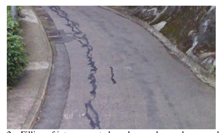
Photo 2 – Filling of interconnected cracks on a low-volume rural road