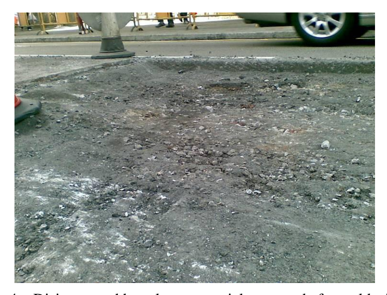
Photo 4 – Disintegrated base layer materials exposed after cold milling