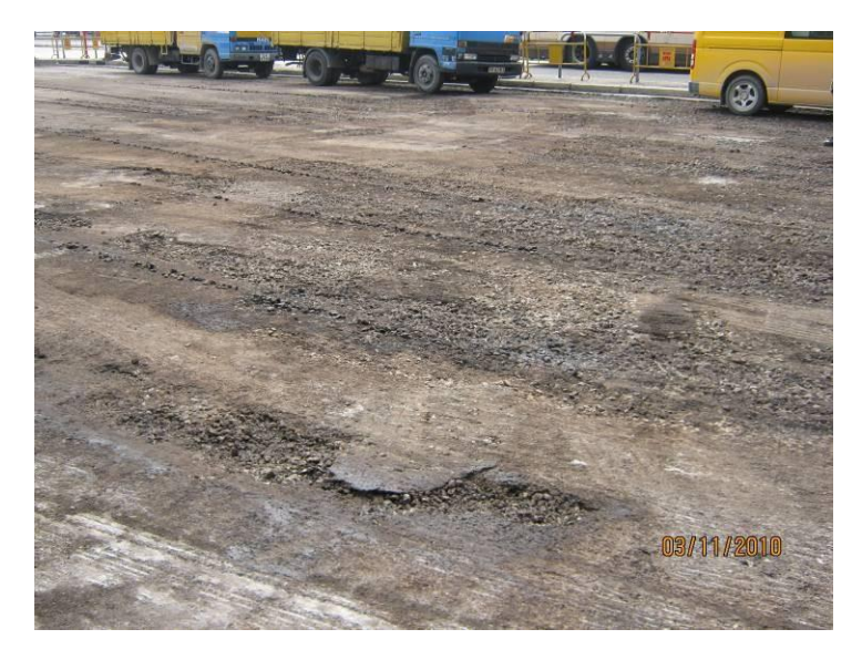
Photo 3 – Disintegrated base layer materials exposed after cold milling