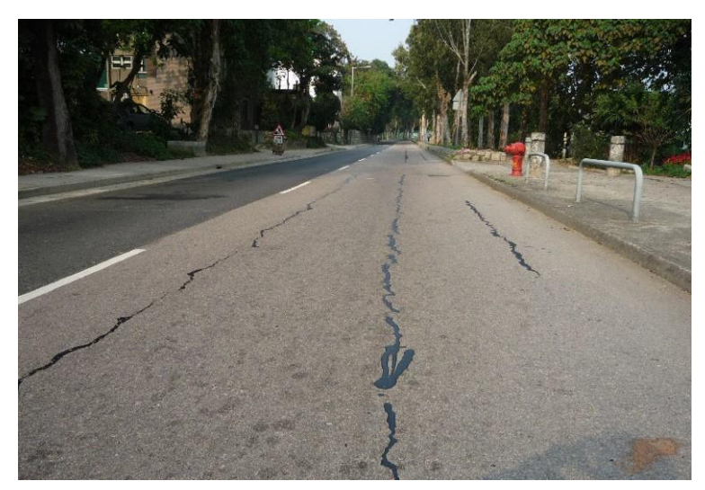
Photo 1 – Filling of wide single longitudinal cracks caused by the adjacent trench excavations