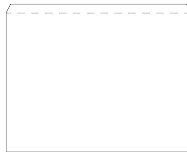
SECTION B - B