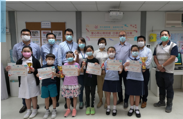
▲ Mask holder design competition

We continued to participate in a wide range of activities in 2020 to maintain close ties with the community. Through these activities, we aimed to promote neighbourliness and collect opinions for continuous improvement. We also took the opportunities to publicize project details in particular the environmental benefits of the projects, and share technical knowledge including innovative construction methods and sustainable measures adopted in work sites.