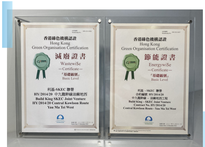
▲ Wastewi$e and Energywi$e certificates of Contract No. HY/2014/20

CIC has been working as a proactive communication platform to promote sustainable construction among organisations and practitioners of the construction industry. CIC’s Sustainable Construction Award, which was first launched in 2018, recognises sustainability best practices among organisations and practitioners, in particular the young generation of the construction industry. It also aims to promote continuous enhancements of sustainable construction in Hong Kong. In 2020, Contract No. HY/2012/06 was granted the Bronze Award in the Category of Project Owner (Public Sector), while Contract No. HY/2012/08 received a Merit Prize in the same category for commendation of their commitment in the adoption of sustainability best practices in the contracts.