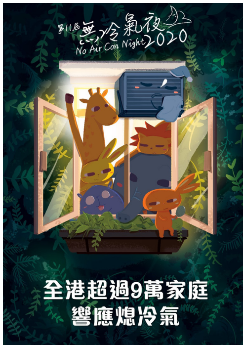
▲ No Air Con Night 2020