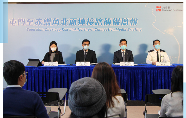
▲ Media briefing