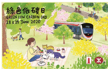
▲ Low Carbon Day 2020