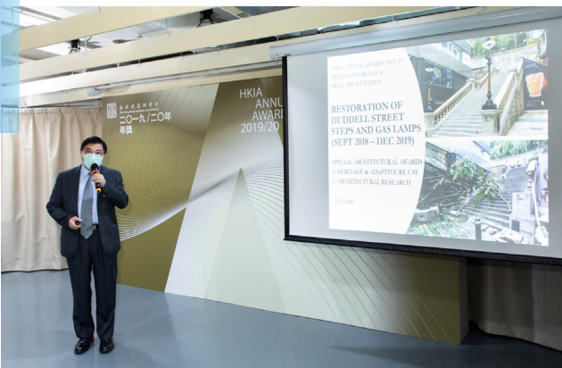
▲ Presentation at Hong Kong Institute of Architects Annual Awards 2019/20