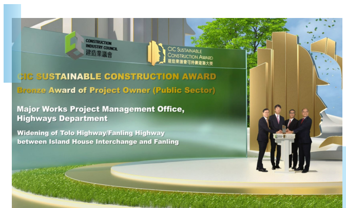
▲ Bronze Award of Project Owner (Public Sector) granted to Contract No. HY/2012/06