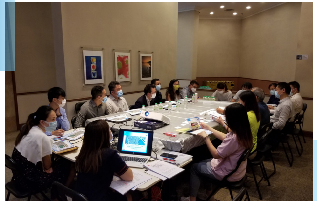
▲ Consultation with stakeholders