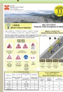
Newsletter of Widening of Tolo Highway project