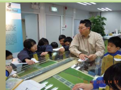
Reception to visit by primary school students