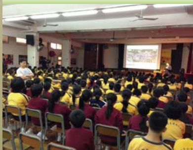
School visit by project team introducing the project background and its environmental benefit