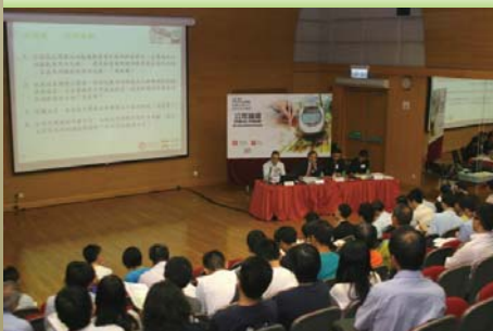
Public forums of Public Engagement exercise organized by Railway Development Office