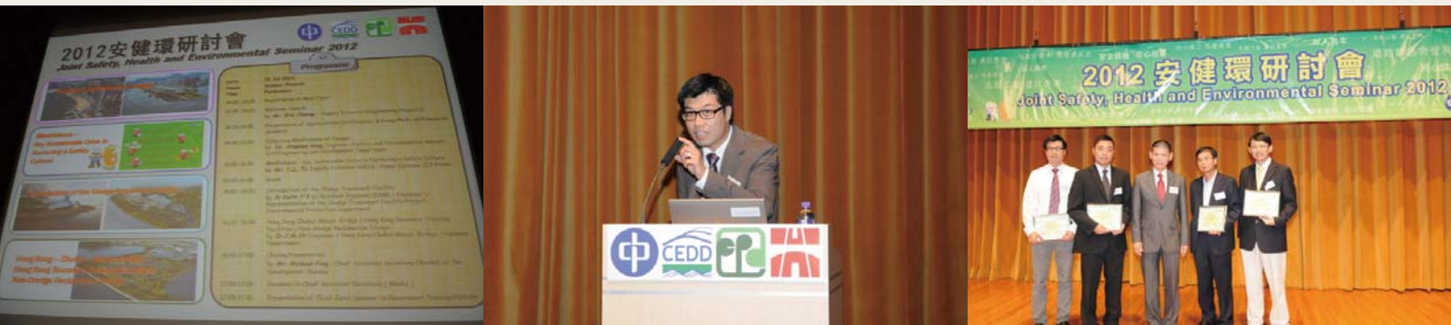
Joint Safety, Health and Environmental Seminar 2012

To enhance our staff's knowledge on environmental management measures, we continued to co-organize the Joint Safety, Health and Environmental Seminar 2012 with CLP Power Hong Kong Limited, Civil Engineering and Development Department and Environmental Protection Department. One of the aim of the seminar was to enhance the knowledge of environmental management measures for the professional and technical staff.