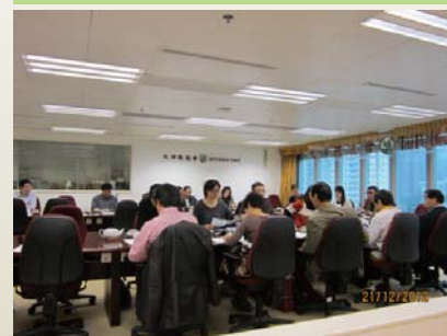
Report of planting works progress to the Greening Working Group of District Council