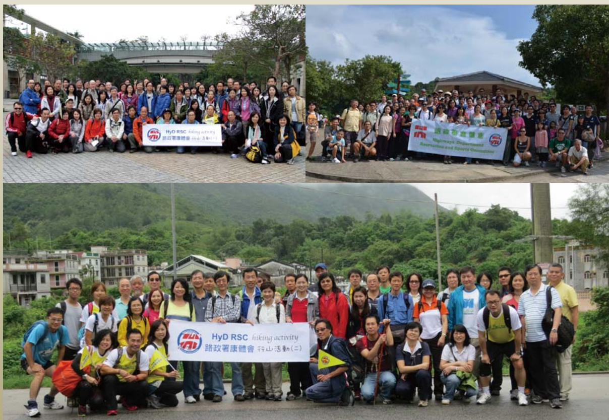
Green activities organized by HyD RSC