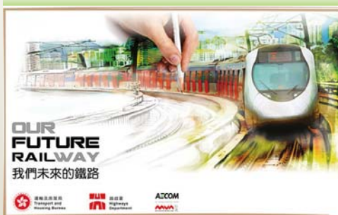
Railway Development Office commissioned the Stage 1 Public Engagement exercise to review and update the Railway Development Strategy 2000