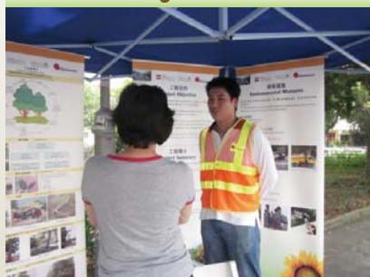
Roving Exhibition of Widening of Tolo Highway project at Kam Shek New Village, Tai Po