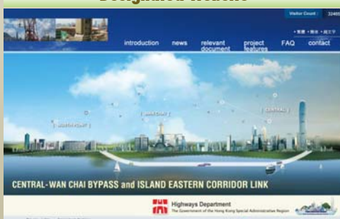
Central-Wan Chai Bypass project website