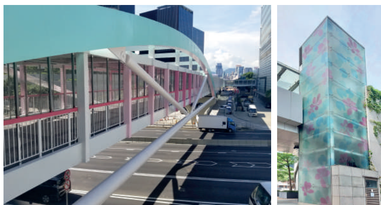
Footbridge at Tim Mei Avenue, Admiralty near CGO

The design reflects with the blossom of "Hong Kong City Flower Bauhinia x blakeana " and "the common local flowering trees" like " Bombax ceiba " and " Delonix regia ". All kinds of flowers are dancing in the wind, weaving dreamy and pleasing stories. The design would like to let pedestrians feel the unique atmosphere created by the place when they pass the footbridges.