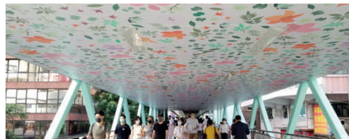
Footbridge at Wan Chai across O'Brien Road