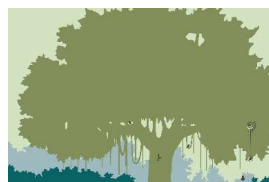
Chinese Banyan ( Ficus microcarpa )

Common large evergreen tree, native to Hong Kong. Its aerial roots will become a stem when reaching soil. The tree can grow in harsh environments, and even on stone walls which become an unique landscape in urban Hong Kong.