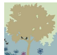
Lance-leaved Sterculia ( Sterculia lanceolata )

Common large evergreen tree, native to Hong Kong. Its aerial roots will become a stem when reaching soil. The tree can grow in harsh environments, and even on stone walls which become an unique landscape in urban Hong Kong.