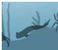
Mudskipper ( Periophthalmini )

Found in intertidal mudflats and mangroves. The males fight with the major claws and feed with the smaller claws. The crabs sift through the sand, which help speeding up the decomposition processes and playing an essential role in the mangrove ecosystem.