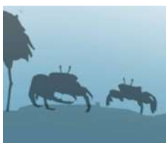
Fiddler Crab ( Uca )

Regarded as endangered species. The migratory birds have flattened spatulate bills. They can be seen in the wetlands of Hong Kong during the period from January to March.