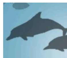
Chinese White Dolphins ( Sousa chinensis )

Mostly found in the wetlands and mangroves. Mudskippers have the ability to breathe through their skin so that they can move around the land and in the water.