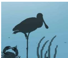
Black-faced Spoonbill ( Platalea minor )

Regarded as endangered species. The migratory birds have flattened spatulate bills. They can be seen in the wetlands of Hong Kong during the period from January to March.