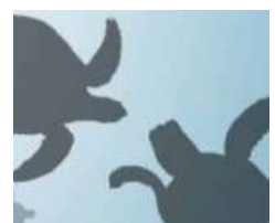
Green Sea Turtle ( Chelonia mydas )

One of the mascots in Hong Kong. The dolphins live in the Pearl River Estuary. The species was first recorded in China as early as in the Tang Dynasty. At birth, the dolphins are dark grey and gradually change to pink.