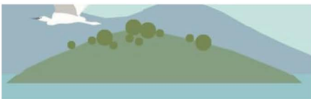
A Chau, Luk Keng

A small island in the Sha Tau Kok Sea, and is one of the major habitats for local egrets.