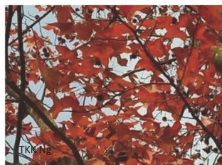
Sweet Gum ( Liquidambar formosana )

A small island in the Sha Tau Kok Sea, and is one of the major habitats for local egrets.