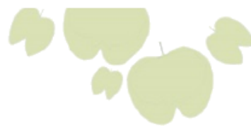
Hong Kong Orchid Tree ( Bauhinia × blakeana )

Native evergreen flowering tree originated in Hong Kong. Known for its beautiful purple flowers, it is the emblem of Hong Kong