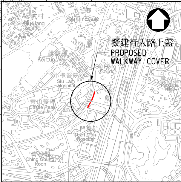
索引圖 KEY PLAN 比例 SCALE 1:15000