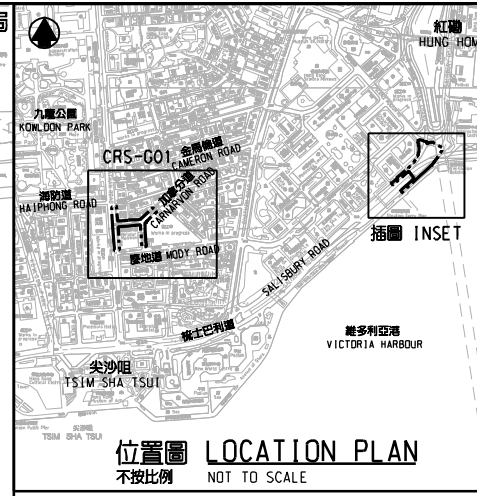
位置圖 LOCATION PLAN 不按比例 NOT TO SCALE