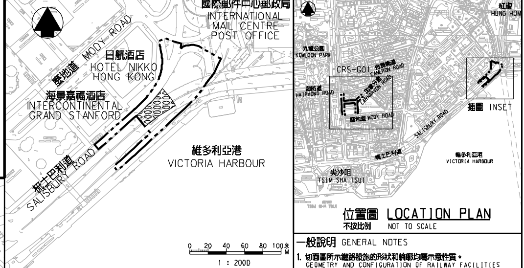
擬在梳士巴利道高架路段底下設置臨時施工區的插圖 INSET PLAN OF PROPOSED TEMPORARY WORKS AREA BENEATH THE ELEVATED SECTION OF SALISBURY ROAD

THIS DRAWING IS PREPARED BASED ON DRAWING NO. CRS-G01 AND IS INTENDED TO SHOW THE TEMPORARY CLOSURE OF THE SECTION OF CARNARVON ROAD (HIGHLIGHTED IN YELLOW), THE TEMPORARY PARTIAL CLOSURE OF SECTIONS OF CARNARVON ROAD AND NATHAN ROAD (HIGHLIGHTED IN PINK AND BLUE RESPECTIVELY), AND THE TEMPORARY PARTIAL CLOSURE OF BRISTOL AVENUE (HIGHLIGHTED IN GREEN).