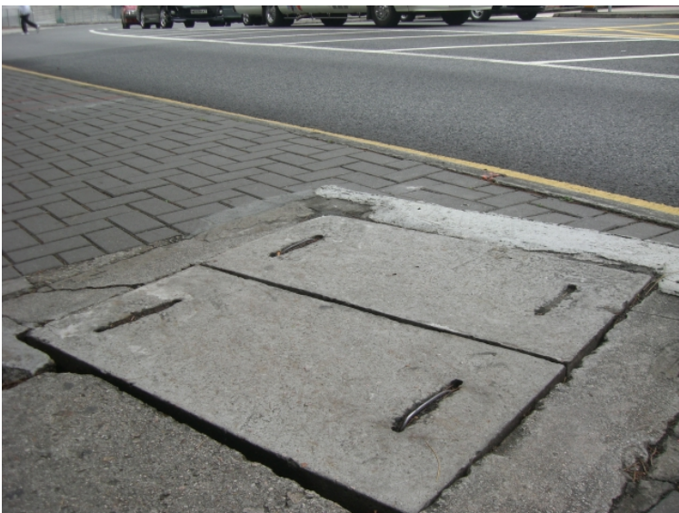
Plate 3: Block cracks were found on concrete slabs around drawpits.