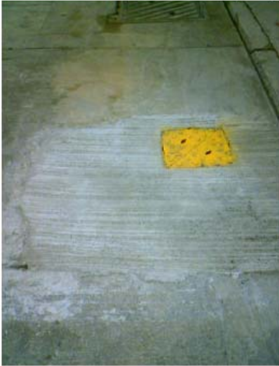
Plate 4: Saw cutting was not carried out.