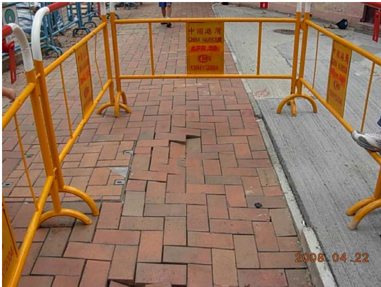
Plate 1: Subsidence of reinstated trench.