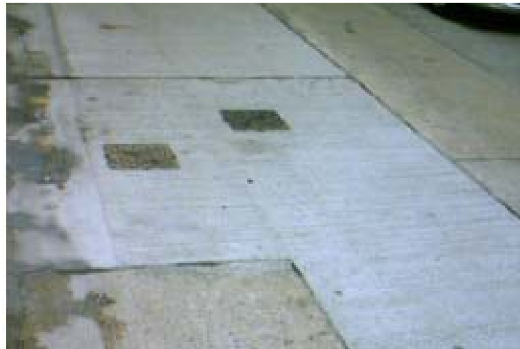
Plate 2: No proper boxing out of road slab was constructed around manhole covers (see Drg. H1111).