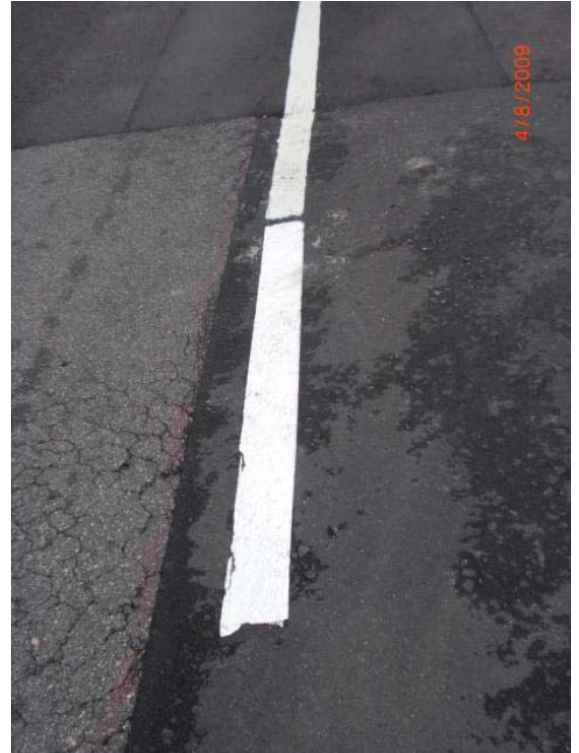
Plate 5: Road marking has not been properly reinstated.