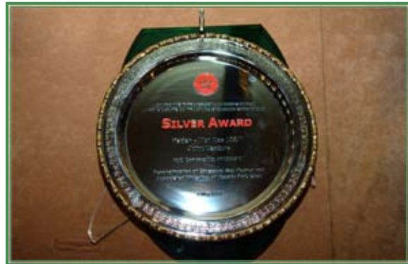
Medal for CCSA Silver Award – Reconstruction of Causeway Bay Flyover and Associated Widening of Victoria Park Road