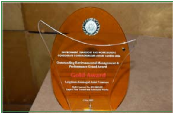
Medal for OEMPGA Gold Award – Route 8 - Eagle's Nest Tunnel and Associated Works

In 2007, we continued to encourage our contractors to participate in territory-wide environmental campaign and award schemes. In 2007, our construction sites were presented with two Outstanding Environmental Management and Performance Grand Awards (OEMPGA) and four Considerate Contractors Site Awards (CCSA) which were organized by the then Environment, Transport and Works Bureau (ETWB) to recognize construction sites with good site safety and environmental performance, and considerate attitude towards the neighbourhood and the public in carrying out the works.