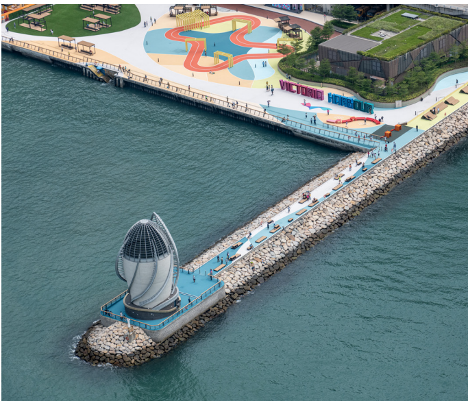
The East Vent Shaft located at the Eastern Breakwater of Causeway Bay Typhoon Shelter

Construction of the CWB commenced in December 2009 and was fully commissioned on 24 February 2019.