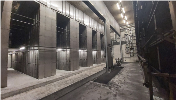
Air Purification System in CWB

Air Purification System (APS) was introduced to CWB for premier use in road tunnels in Hong Kong. Its scale is also the largest of its kind in the world. It is designed to remove 80% of respirable suspended particulates and nitrogen dioxide from the tunnel exhaust. The APS plants are situated in the three tunnel buildings and can handle up to 5.4 million cubic meters of tunnel exhaust per hour.