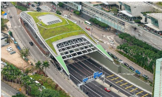
The Central Tunnel Portal / West Ventilation Building